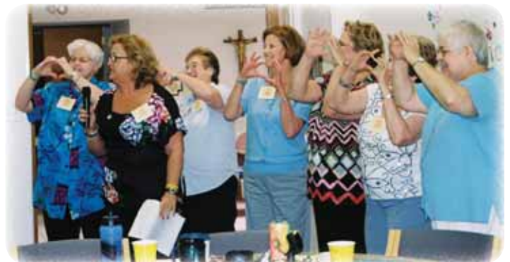
SLW Associates demonstrate their vision of the future for Associates.