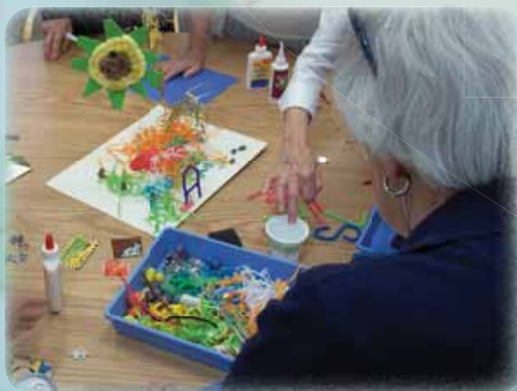
SLW work at designing future