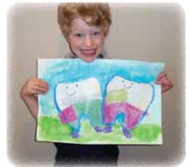
Julie Billiard student and his prize winning work.